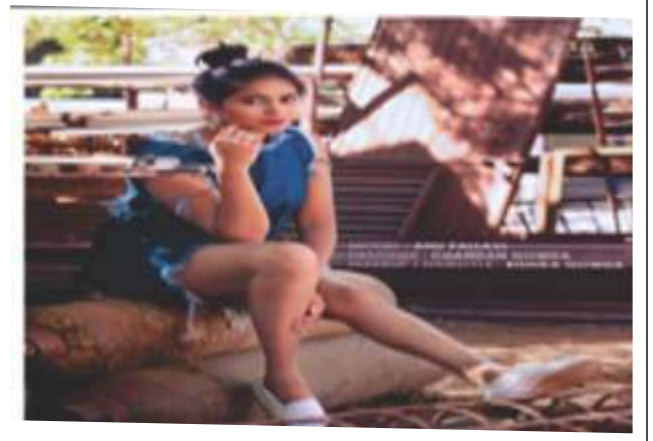
Anupallavi- Freelance Model