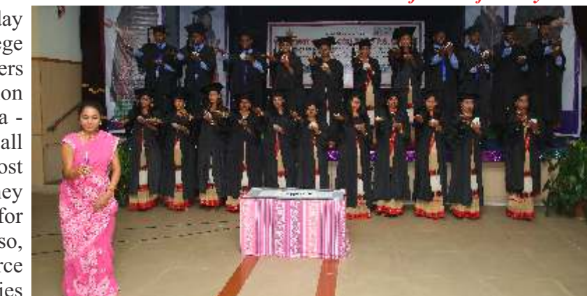
Students Taking Oath