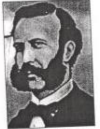
Jean Henry Dunant Founder of Red Cross 1828-1910

# 26, Red Cross Bhavan, 1st Floor, Race Course Road, Bengaluru - 560 001. Ph : 080-22264205 / 22340844 E-mail: ircskar@gmail.com / ircskarnataka@yahoo.in, Website : www.redcrosskarnataka.org Karnataka Red Cross, Blood Bank - 080-22268435