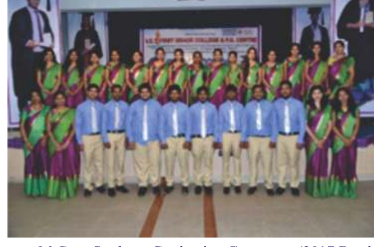
M.Com-Students Graduation Ceremony (2017 Batch)