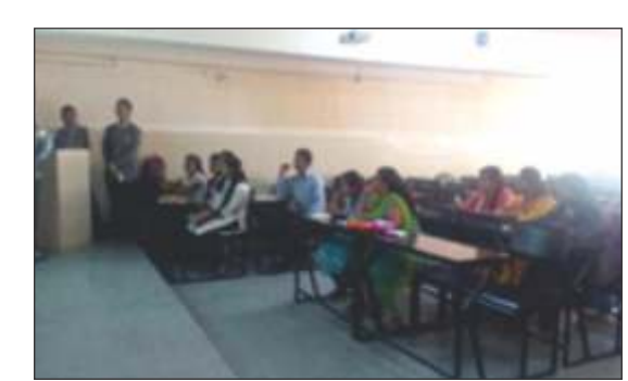
Role Play by B.Com Students