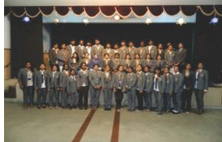
B.Com-Outgoing Students (2018 Batch)