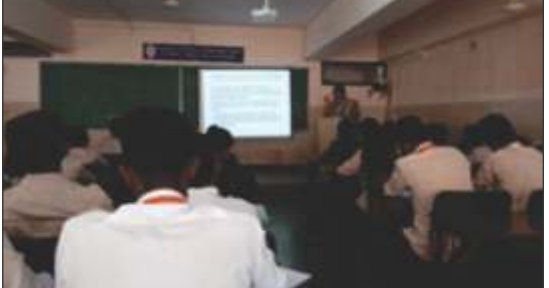
Lecture, Power Point Presentation