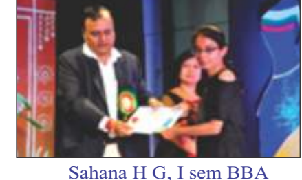
Awarded as class topper