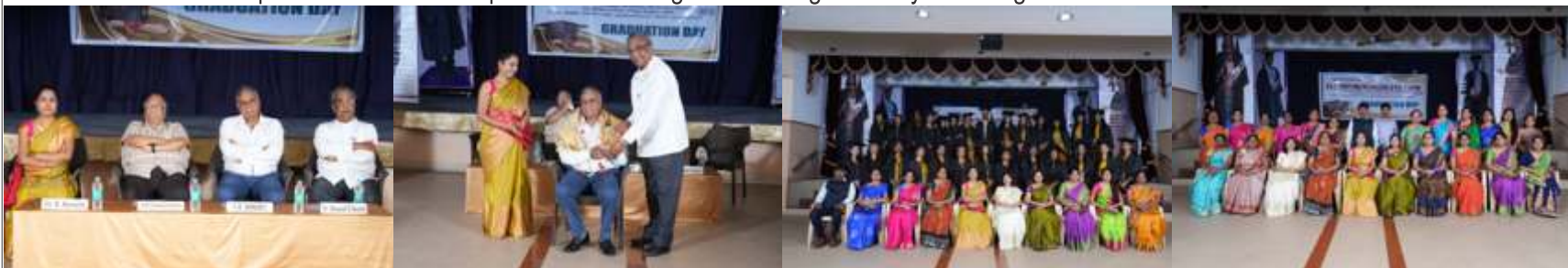
Glimpses of Graduation Day-2022

The formal program concluded with vote of thanks and tossing of the caps by the outgoing students. It was indeed a joyous and memorable day for the students and their parents. The students parted after having the lunch organized by the college.