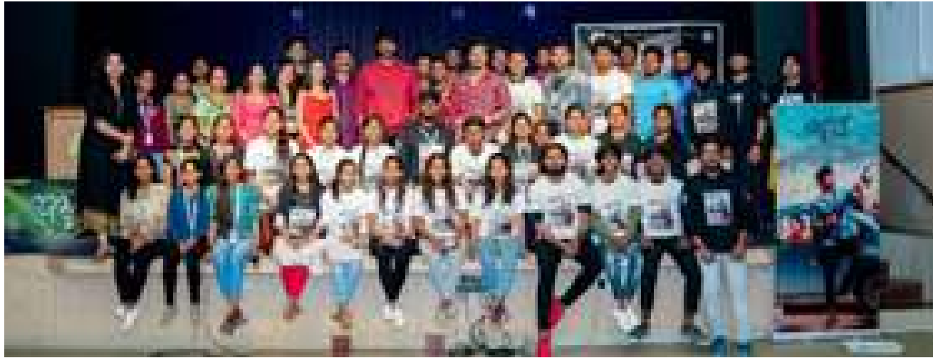
Glimpse of Celebrity Meet