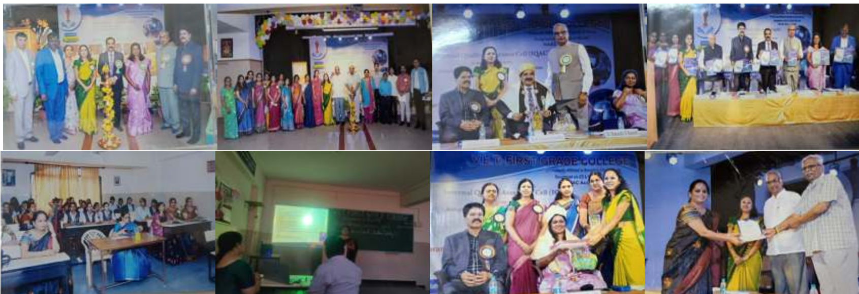
Glimpse of National Conference-2023