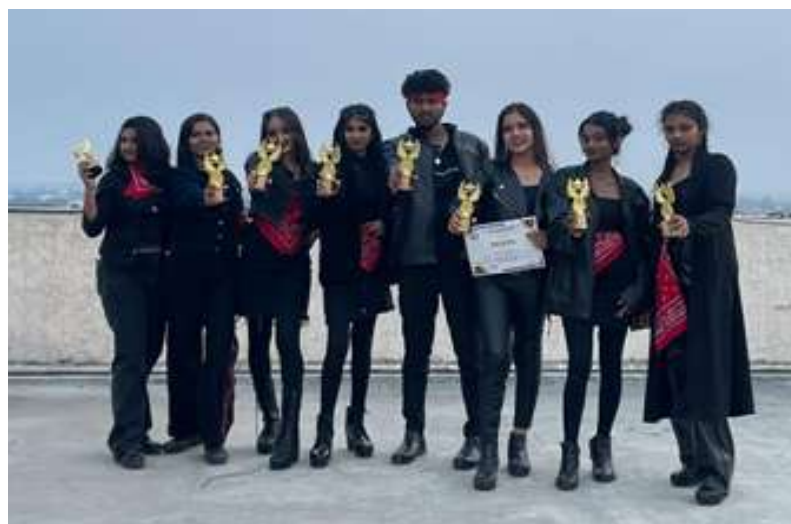
Our students being felicitated after securing Second Prize in the Intercollegiate Fashion Show at Seshadripuram Academy of Business Studies.