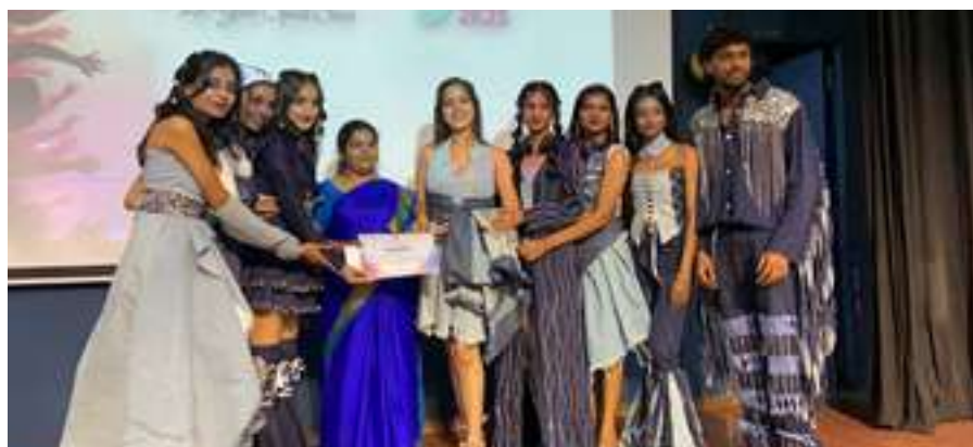
Our students, being felicitated after securing 1st Prize in the Intercollegiate Fashion Show at KLE's S. Nijalingappa College