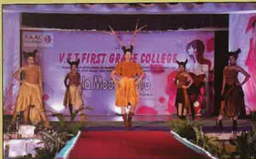
Theme : Antelope