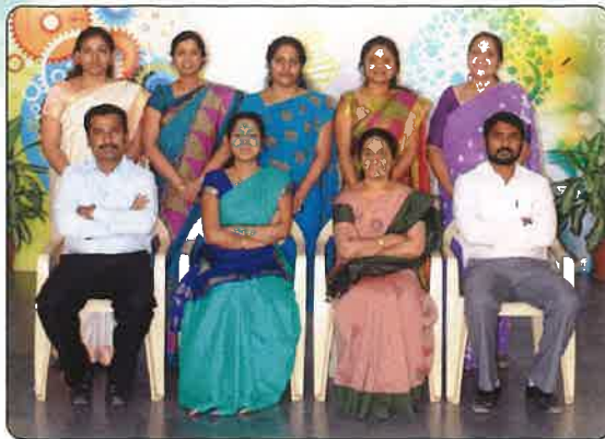
P. G. Academic Team