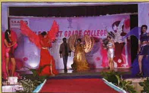
Theme : Ruffles