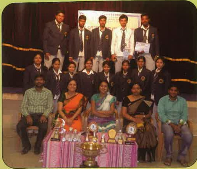
BCA - CLOUD COMPUTING