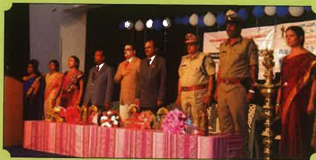
Justice & Police