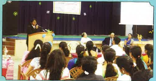
Inter College Seminar