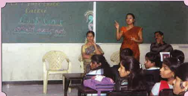
NSS Unit Meet