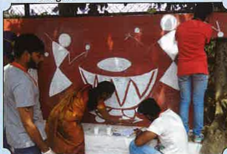
Painting the Wall