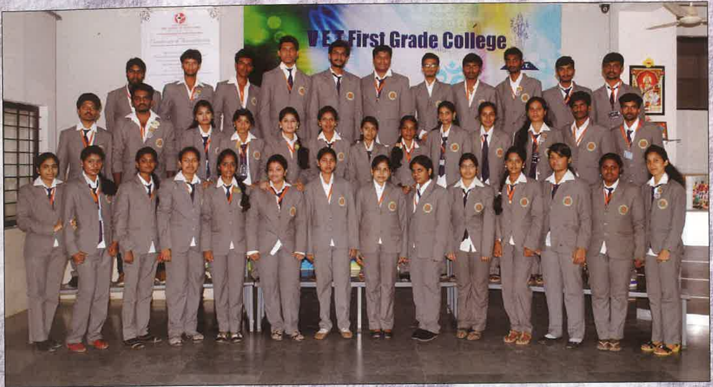
B.Com. "A" Section