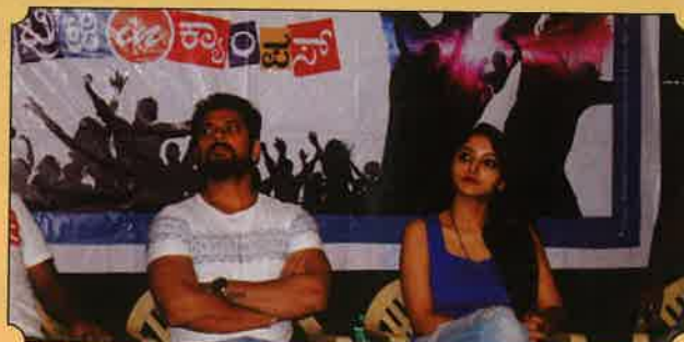
Cine Stars - Praveen & Meghana