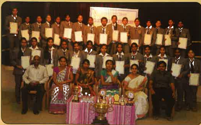
B.Com. - CPT Crash Course