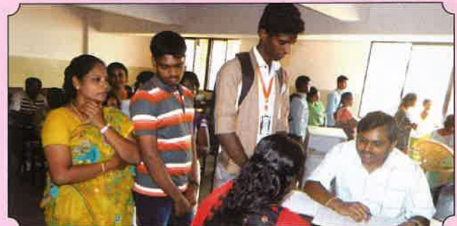
Parent Teacher Meet