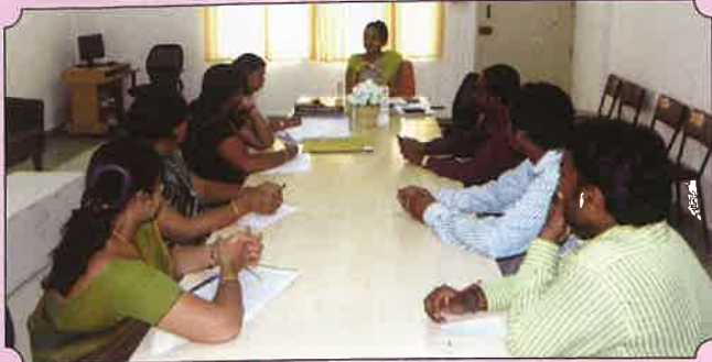
IQAC Staff Meeting