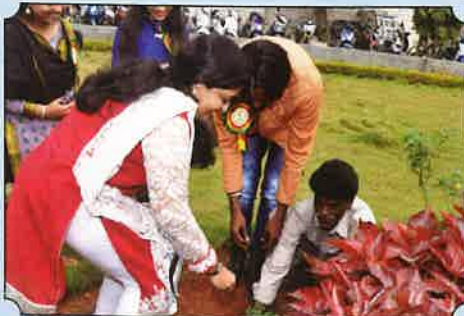
Planting of a Tree