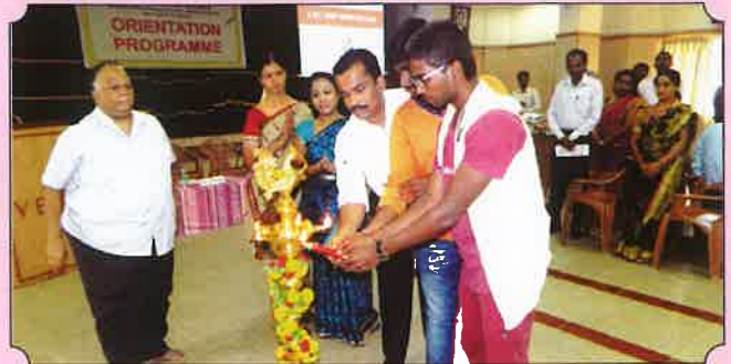
U G Orientation