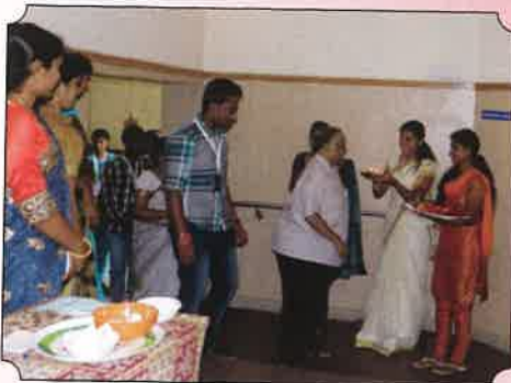
International Elders Day