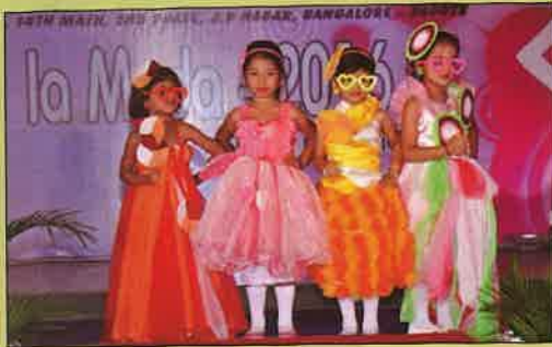
Theme : Candy