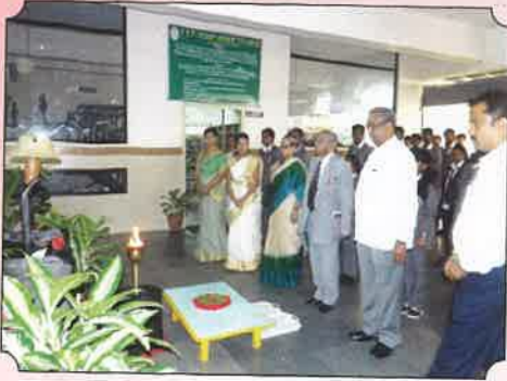
Martyr's Day Celebration