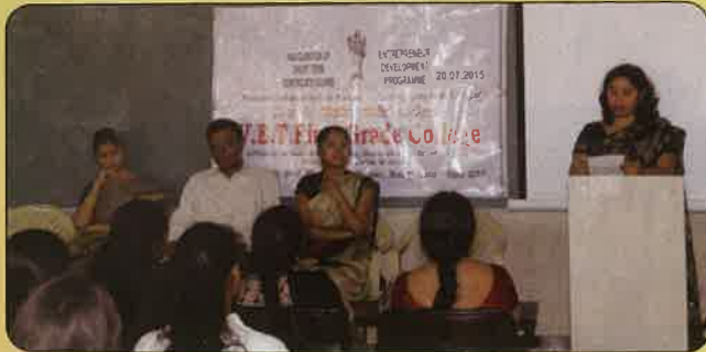
B.Sc. - FAD EDP Course