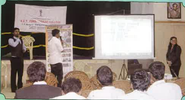
Seminar Presentation by M.Com. Student