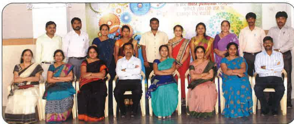
U. G. Academic Team