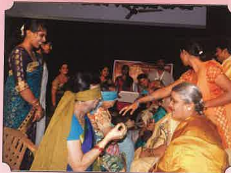
International Elders Day