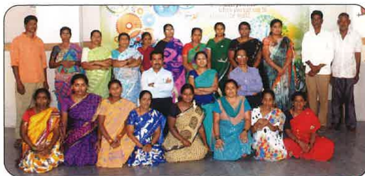
Non Teaching Staff