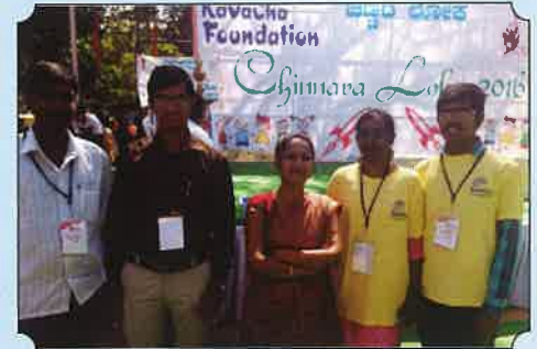
Panel of Judges at Chinnara Loka