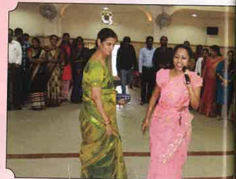
New Year Day Celebration