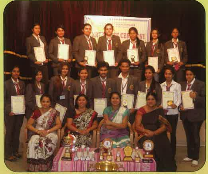
B.Sc. - FAD Fashion Accessories