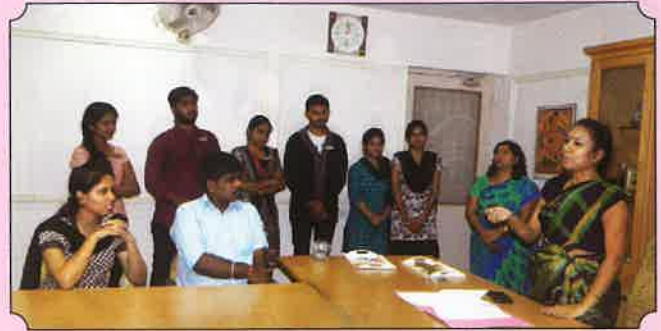
Student Welfare Meet