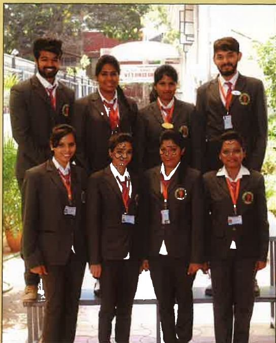
B.Sc. - FAD Students