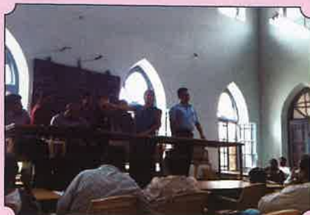
Custodian of English Valuation Camp Meet