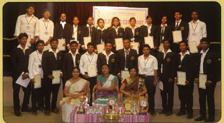
M.Com., Advanced Communication Skills