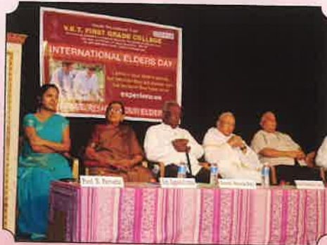
International Elders Day