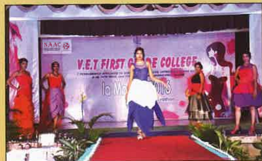
Theme : Fuchsia