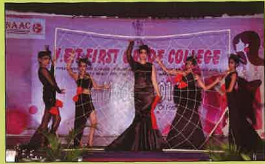
Theme : Black Widow Spider