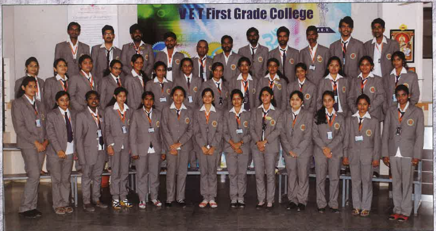
B.Com. "B" Section