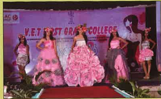
Theme : Rose