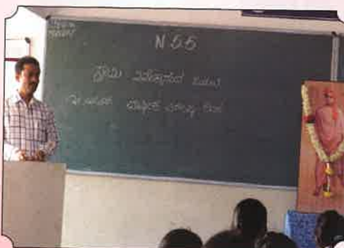
Swami Vivekananda Jayanti