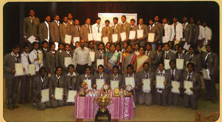
B.Com. - Tally