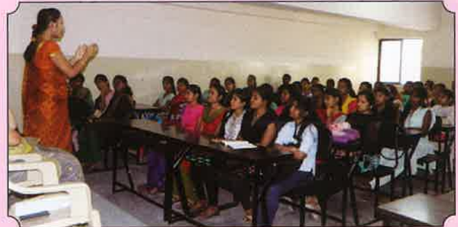
NSS Student Meet