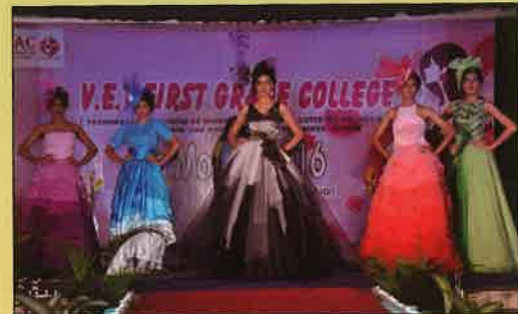
Theme : Monochromatic