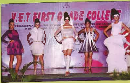
Theme : Architecture