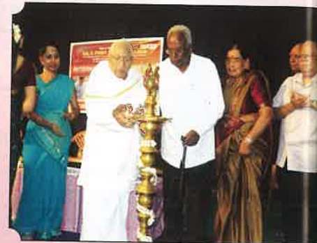
International Elders Day