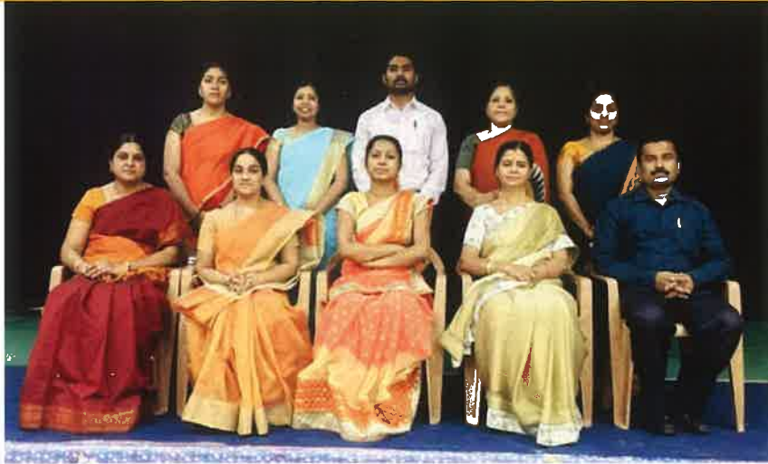
Post Graduation Academic Team