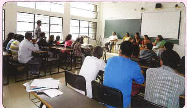
EDP Cell Inauguration