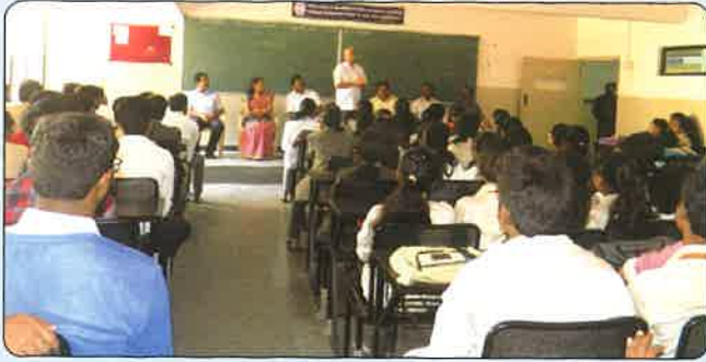
Job Mela Orientation