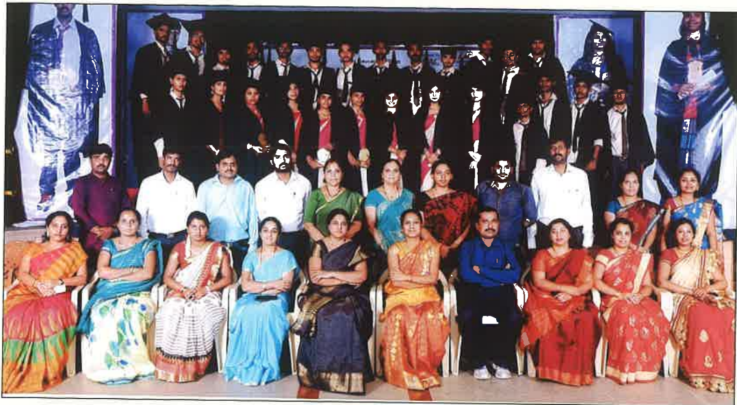
BCA FAD 6th Semester - 2015-16