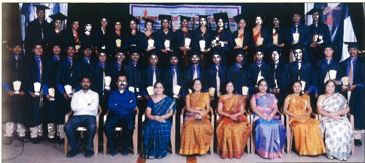
B.Com. 'B' Section - 6th Semester 2015-16