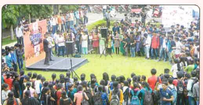
FM Radio City at VET