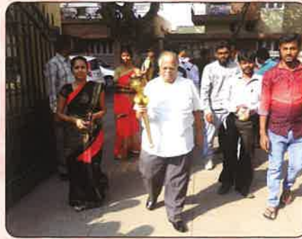
Sports Torch by President