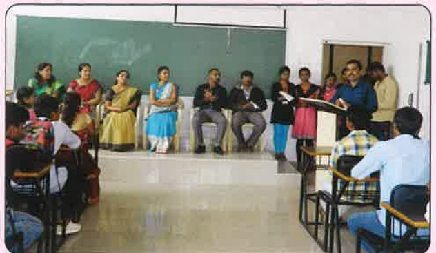
NSS Students Meet