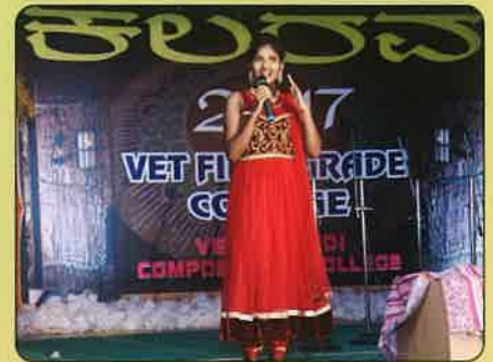
Hair Style Competition