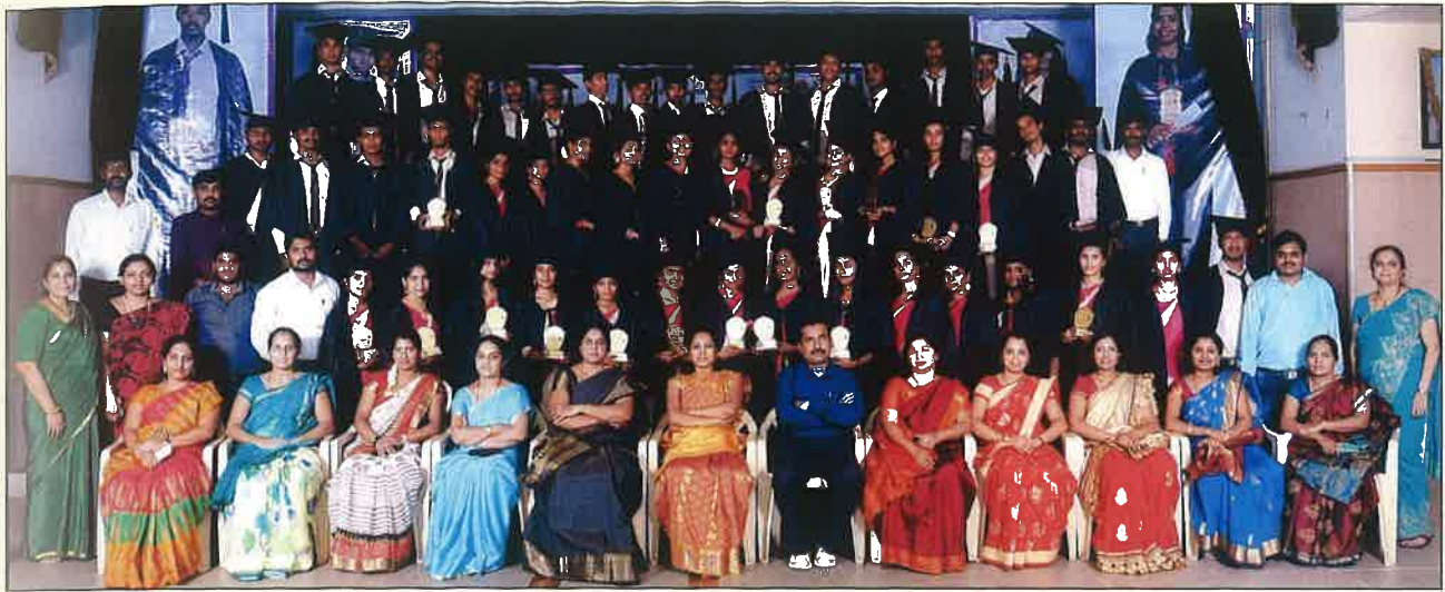
B.Com. 'A' Section - 6th Semester 2015-16