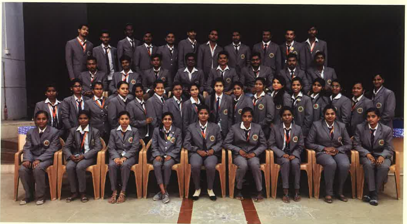
VI Semester B.Com. 'B' Section