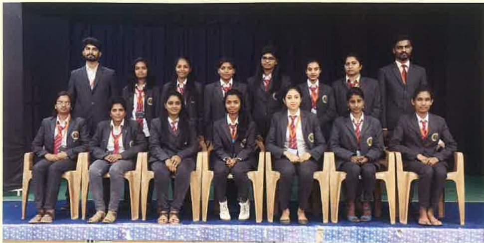
VI Semester B.Sc. FAD