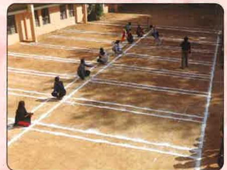
Girls Kho - Kho