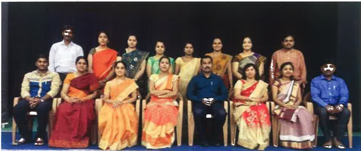
Under Graduation Academic Team