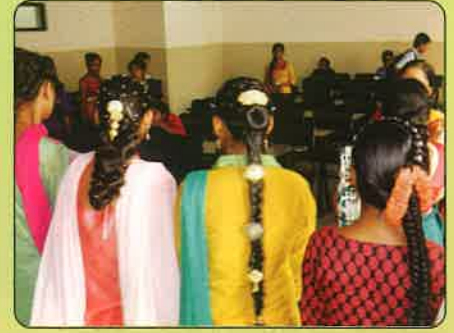
Hair Style Competition