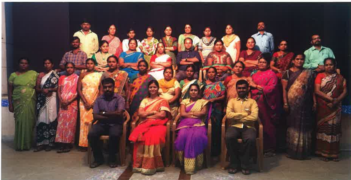
Administrative Staff & Non Teaching Staff