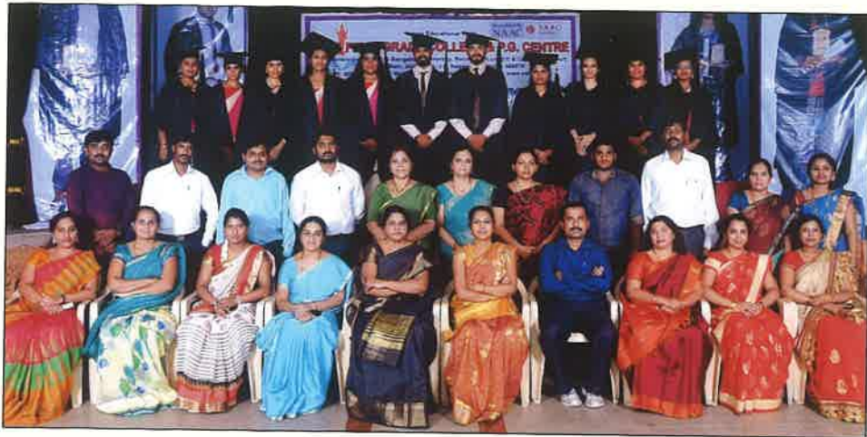
B.Sc. FAD 6th Semester - 2015-16