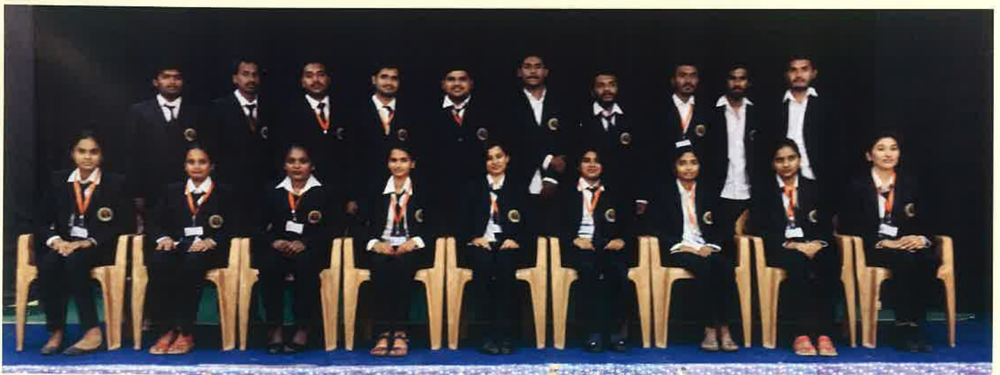
IV Semester M.Com.