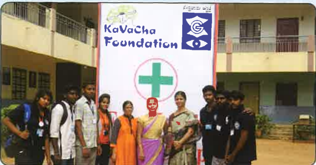
Medical Camp in association with Kavacha Foundation