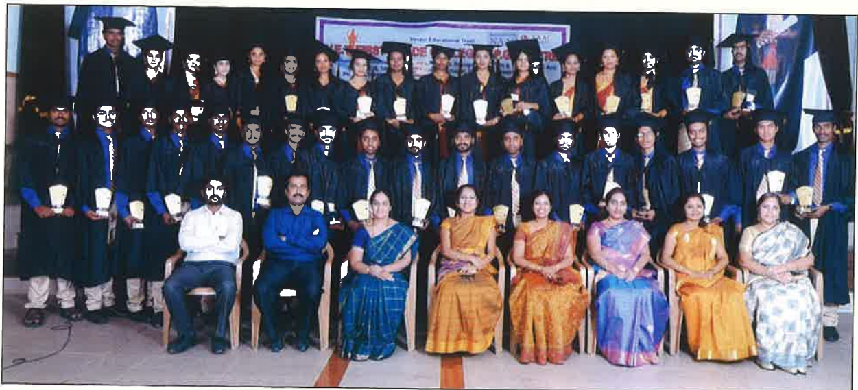
M.Com. - I Batch