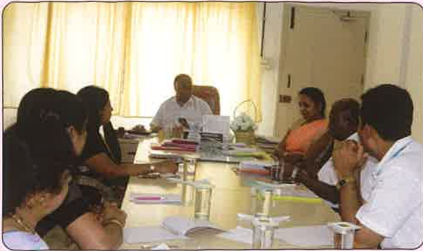
Academic Governing Council Meeting