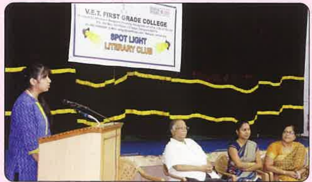
Literary Club Inauguration