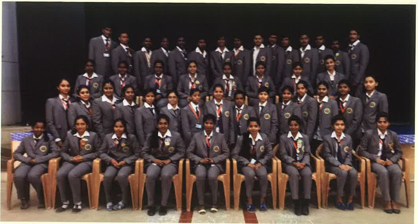
VI Semester B.Com. 'A' Section