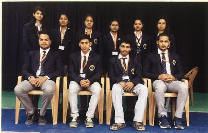
VI Semester B.C.A.