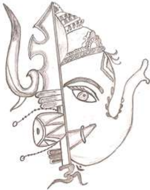
Prajwal, IV sem M.Com